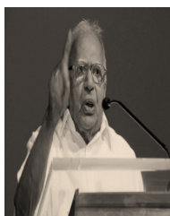
Justice V.R. Krishan Iyer