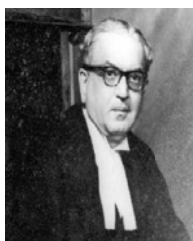
CJ M.C. Chagla

These great legal luminaries defined our past and left behind a scintillating legacy of their genius. These were the rare men with rare cognitive abilities.