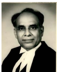
Justice H.R. Khanna